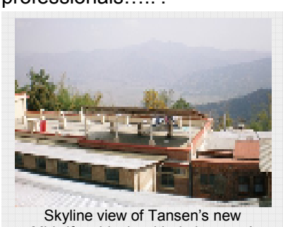
Midwifery block, with drying area!

(Chief of the Department of Medicine) has the vision and drive to direct the future of the Academy. In an article in the Patan Hospital Souvenir Brochure (2007) he states 'the goal is to train technically competent, caring and socially responsible physicians and other health care professionals.....'.