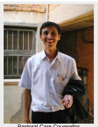
Pastoral Care Counsellor