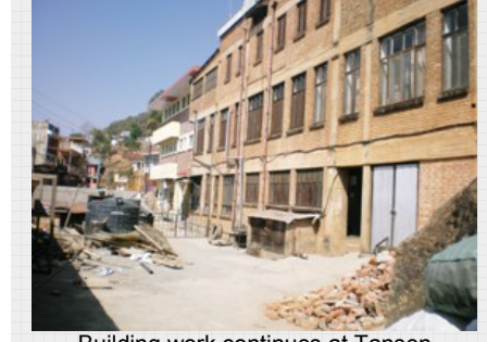
Building work continues at Tansen

will be sent with our encouragement that the management staff continue to recognise and respond to the necessity for charity care provision as they produce their annual budgets. At the same time it is pleasing to note the good levels of charity care achieved in the past year.