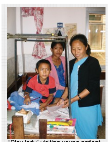
Play lady" visiting young patient

and will assist in the setting up of a support structure in Kathmandu for management and logistical support. However the hospitals will be seeking a viable alternative option for independent legal status which is targeted to be by 2010.